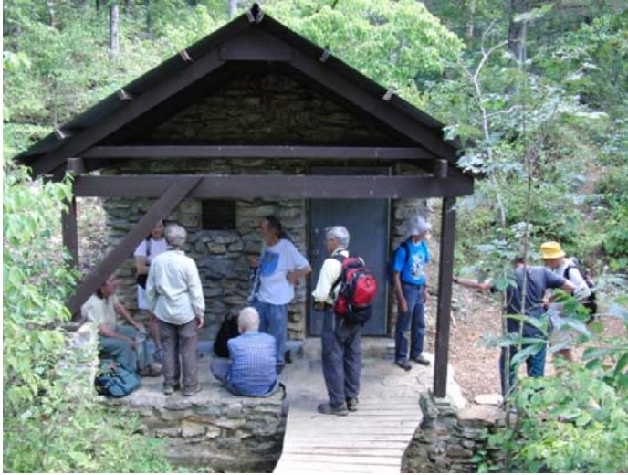
UCHC cavers waiting for elevator at entrance to Tumbling Creek Cave.