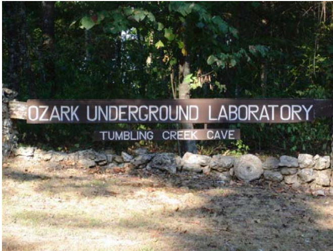
Tom Aley's haunt - a very suspicious name